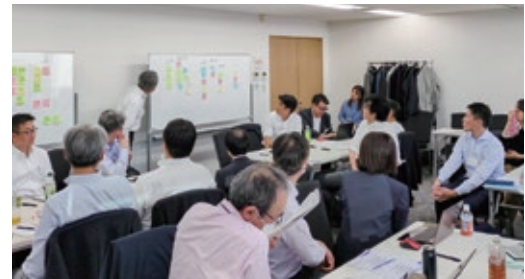
Human rights due diligence workshop